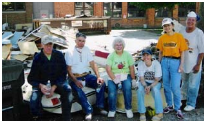
Taking a break on the rubble pile.