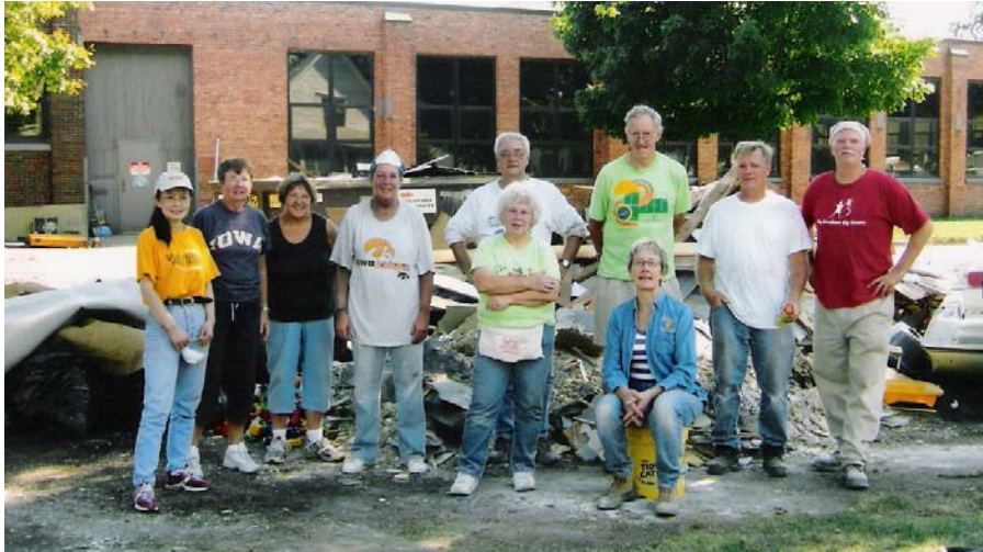
Mission Trip #2 to Cedar Rapids, August 2, 2009. Mission Trip #3, Sept. 20. See p. 7 for more information.